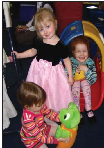
Kids are first at Second!