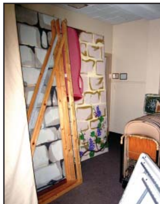
Scenery is tucked away until next year.

Overnight, they disappear. The Jerusalem Market, Bethlehem, the Rabbi's House, Herod's Palace, and Caesar's walls. Where do they go? Each year, the removal of the Journey to Bethlehem in time for Sunday worship happens because tired but willing volunteers break it all down and put it away. Scenery flats, props, and other parts are stashed away in a former classroom space on the 3rd floor of the (old) education building. Larger pieces of scenery are now stored in PODS offsite. Custodians work very late sweeping up the debris of five or six hundred visitors. You're not an actor? Then why not organize your friends and family to be a clean-up team this year? You'll be part of making a "miracle" happen - and heavenly pizza will be served.